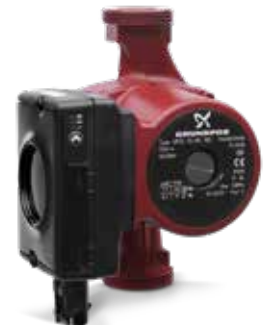
UPS2 25-80 / 32-80